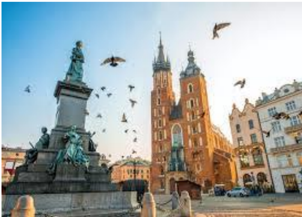
ST. MARY'S BASILICA, KRAKOW, POLAND