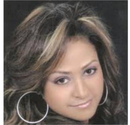
Dalia Farouk Soprano